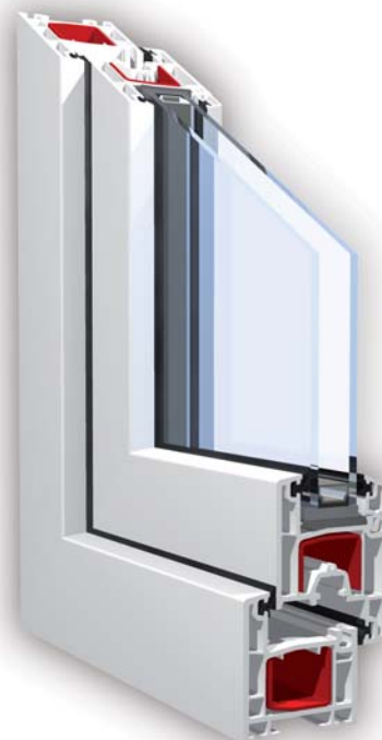
Three chamber double seal system with 58 mm installation depth

Every person is different. Which is fortunate, because that makes our world such a colourful place. And as different as people are, as equally diverse are their preferences for form and colour. Whether panel windows, round or basket arches, single- or multi-sash windows, round or triangular windows – with KBE everything is possible. This varied range of forms gives you the freedom you need to unfold your imagination! And the wide range of colours and wood grain laminates provides you with additional potential for giving your home that completely personal touch.