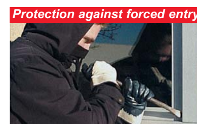
Protection against forced entry