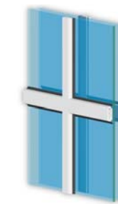
Stick-on Georgian bars