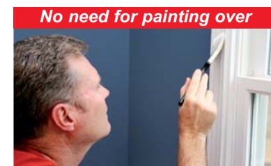
No need for painting over