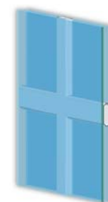
Internal Georgian bars

KBE System windows are designed in accordance with the state of the art. They fulfil all requirements that demanding developers expect of windows today.